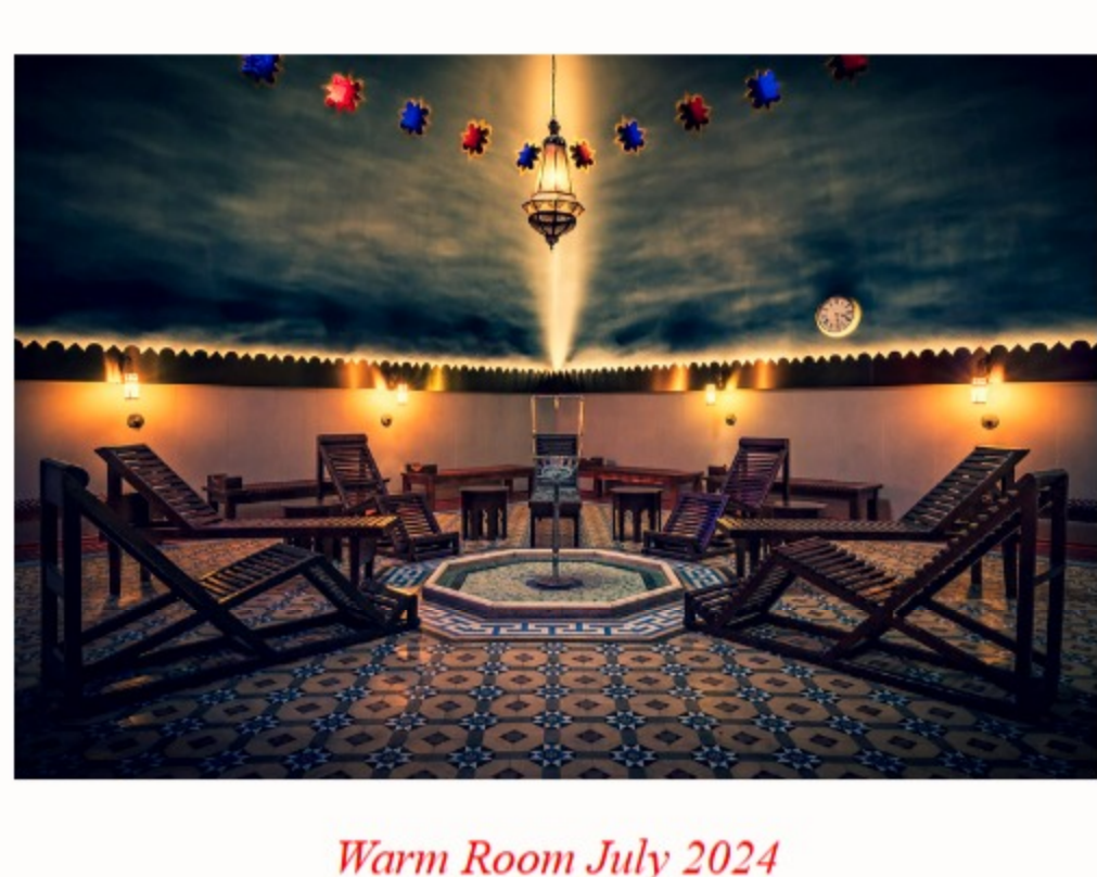
Warm Room July 2024

The Turkish Suite was added to the Club along with the Foyer and Member's Lounge with the 1875-76 extension of the building. As with the 150th anniversary of the formation of the Club, there will be a series of events during 2025/26 to celebrate the Turkish Suite. Please send any suggestions to the General Manager.